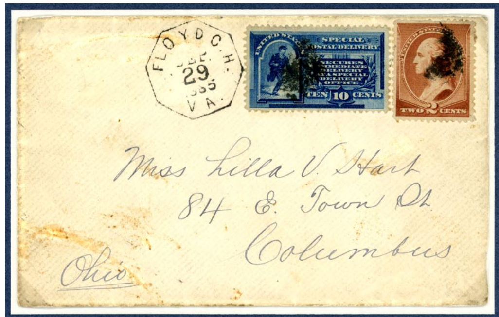
First Day of Use, two days before stamp issue and beginning of service Oct. 1, 1885