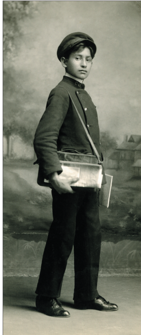
Original Photo Artwork, unique