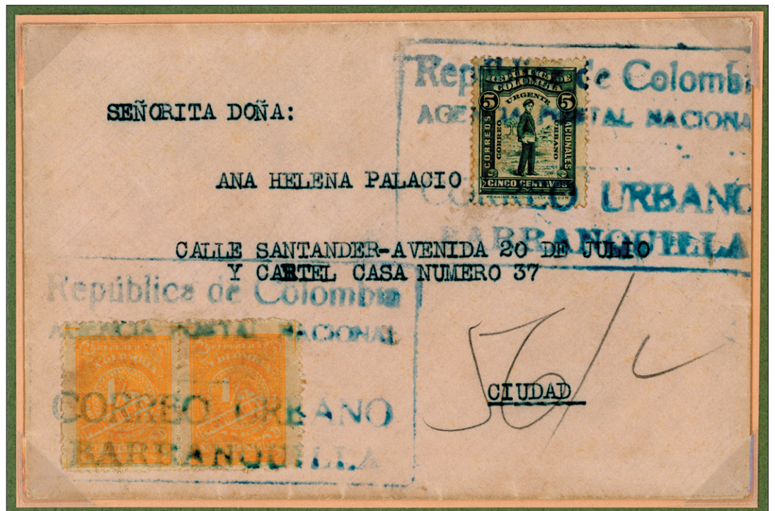
City special delivery service, 20 July 1917, 3 examples recorded