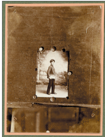
Subject vignette, unique