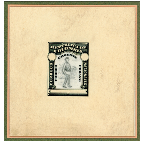
Frame Vignette, unique

Columbia issued a five centavo stamp which featured a foot messenger taken from a vignette in the Perkins Bacon archives, the stamp's printer. Perforated 13.5, it is printed in a Kelly green shade and imprinted "Correo-Urgente-Urbano," a city special delivery stamp with only 22,000 printed.